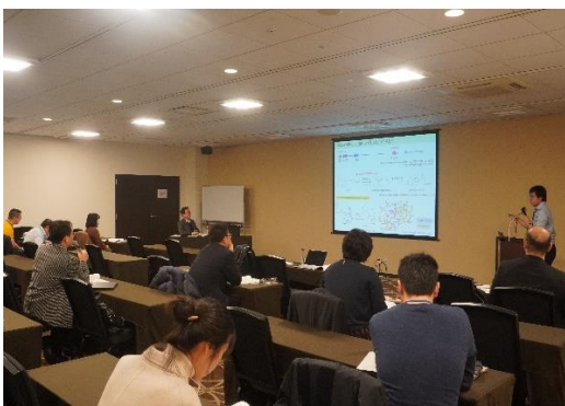
Young Scientist Session