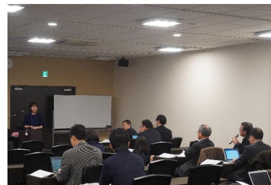
Young Scientist Session