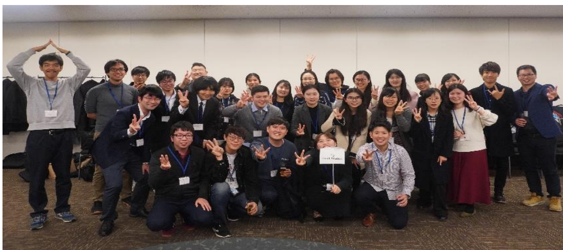
Promising Young Scientists

Our 3 rd annual meeting ended successfully with excellent talks and great contribution by A3 members. There were 55 oral presentations by the leading researchers, and 25 Postdocs and Graduate Students from China, Korea, and Japan made short oral presentations as well. It was a quite challenging for PDs and students to present their works in front of world-famous PIs, yet this was a great chance for them to learn the level of researchers in Asia. It is worth mentioning this A3 annual meeting provides a platform and opportunity of communication and collaborations for not only the members but also young scientists.